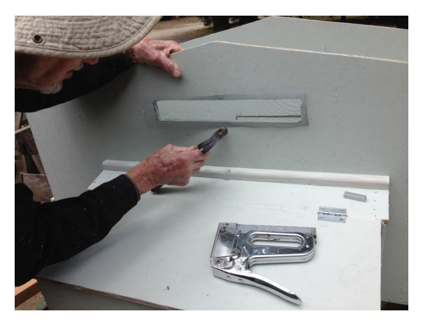
5. Cover vent openings with window screen, to exclude flies and predators and allow for ventilation.