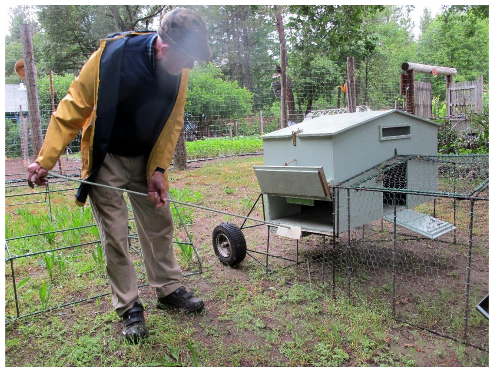
6. A simple hoe-like tool may be constructed to clean out the coop through the clean out door.