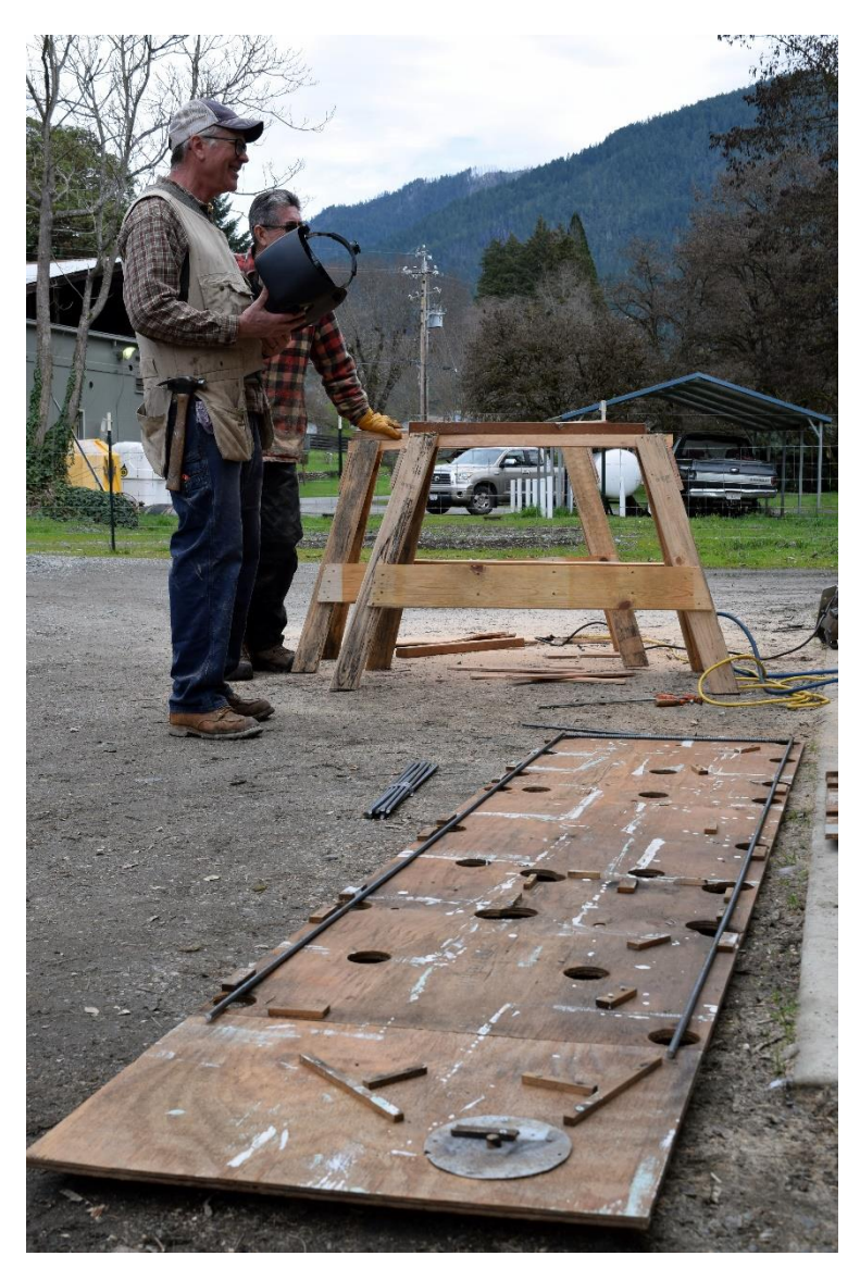
7. Wilson's template, used to weld the long side panels.

8. Corner clamps fabricated by Wilson to hold rebar in place for welding.