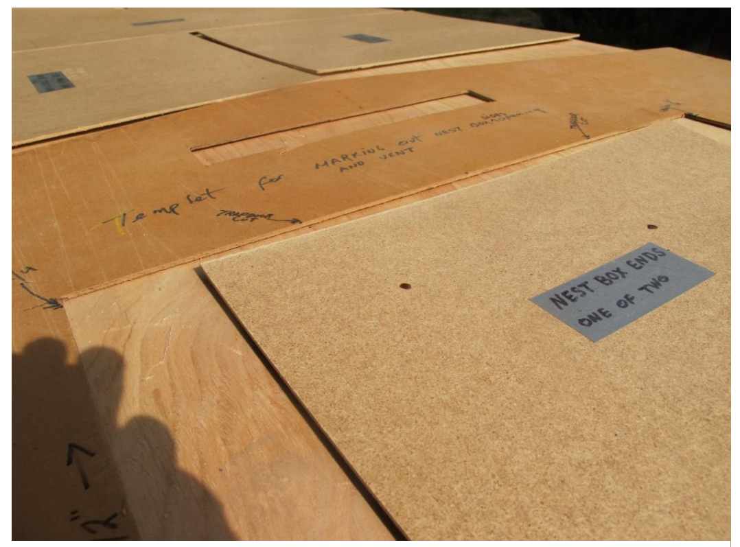
1. Careful positioning of templates facilitates the most efficient use of plywood.