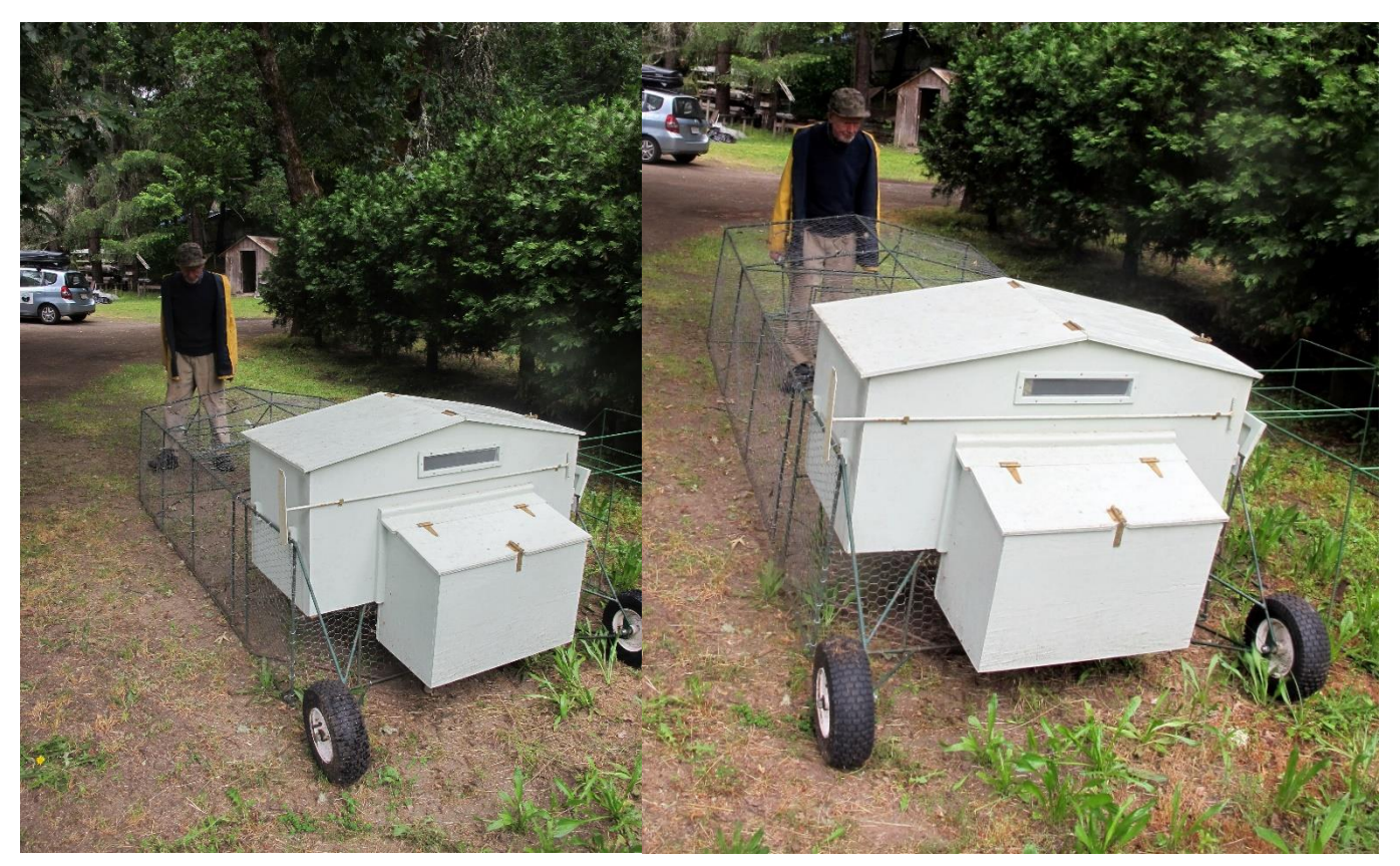
10. Bolt 11" wheels to wheel brackets. Position of wheels is critical: wheels should be off the ground when the tractor is in place, but engage when the tractor is lifted slightly, allowing it to be moved easily.