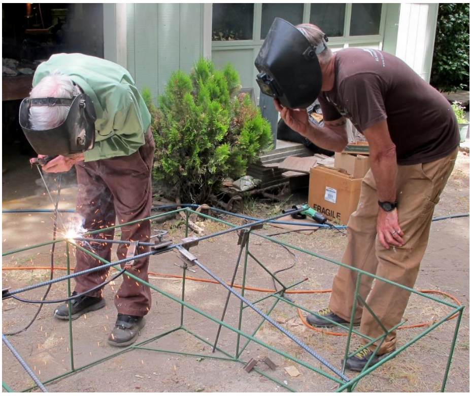
9. Weld side sections together with cross members. Add braces, ridge, rafters, and handle sections.