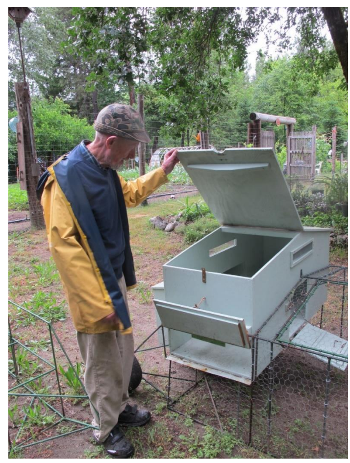
4. Add hinges and latches to doors. Note that only one side of the roof is hinged.