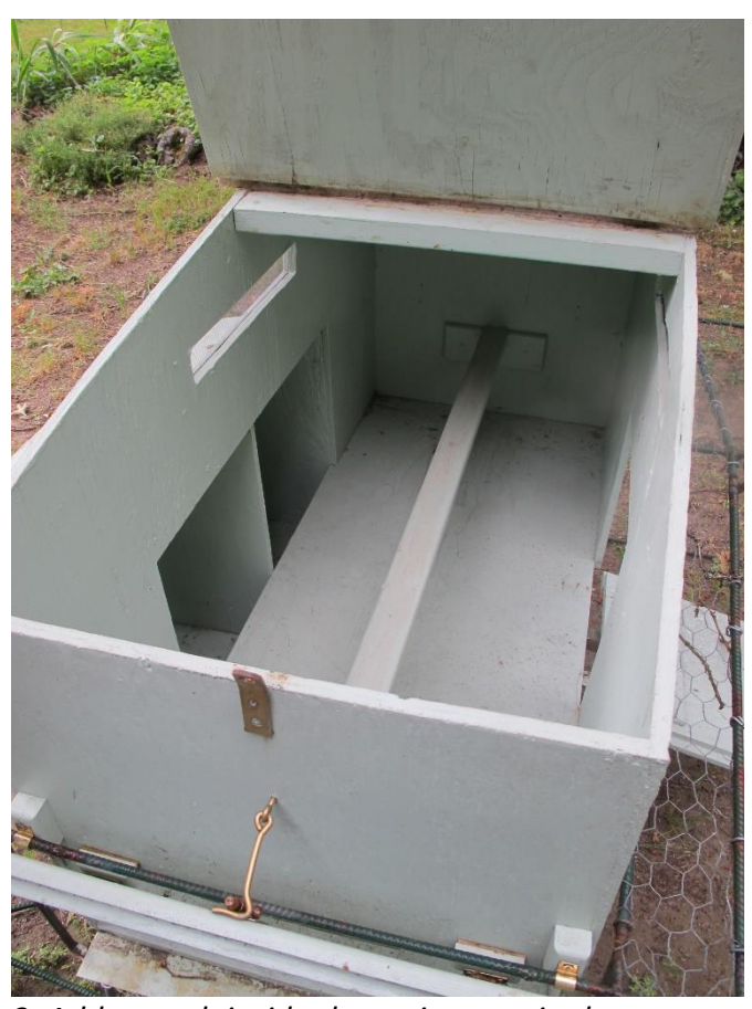
3. Add a perch inside the main room in the center along the long dimension. Note that the nesting box has a middle divider to create two sections.